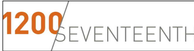
Exhibit A – Building Standards & Specifications

Base Building Wood Doors – Eggers based on Owner's Sample. Species: Quartered Ribbon Stripe Sapelle (FSC-COC), Horizontal Grain, Gardall Finish. Submit three (3) material samples for Landlord review and approval.